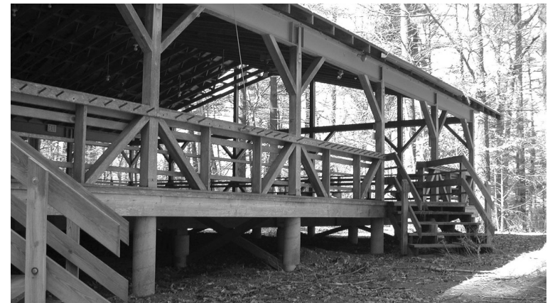
C# as it looks today.

In the 1960s, when I was a child, my family spent three or four weeks every August at the Point on Long Pond. Although not a result of my grandparents having ownership of Pinewoods at that time. Activities in C# were often what started and ended each day; from Morris dance class at 9:00 in the morning until the end of the evening dance, it seemed to me that the woods ending, though. The building itself seemed so embedded in the landscape that I considered it an unchanged part of the original camp fabric. Imagine my surprise when, about two years ago, I discovered that there had been a previous version that I had never heard about! This discovery came when I was viewing old thought of as "C# version one" actually had a predecessor!