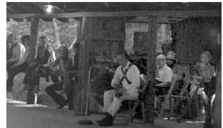
Interior and old band-shell C#-II